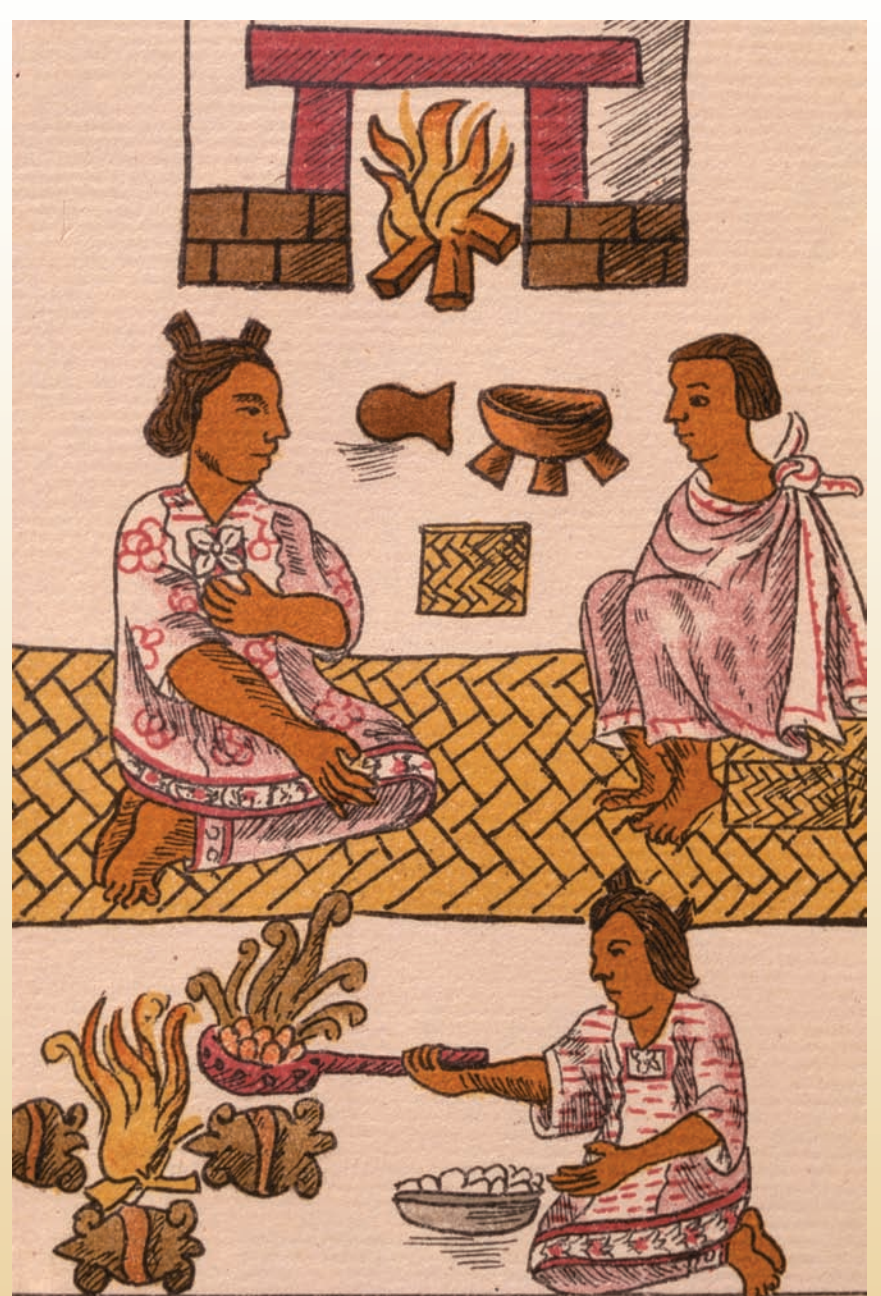
Aztec artwork showing daily activities of women.

Brumfiel also focused on how everyday women lived and how the expansion of the Aztec Empire had affected them. She found that women's workload increased under the Aztecs. Brumfiel studied Aztec artwork for evidence of differences in status based on gender. In art from the Aztec capital of Tenochtitlán, images of militarism and masculinity became increasingly important with the growth of the empire, thus elevating the position of men. Sculptures of women, on the other hand, showed them in positions of work (kneeling). Yet the images of women in the area of Brumfiel's fieldwork did not change. Unlike their rulers, these commoners usually depicted women as standing, not kneeling.