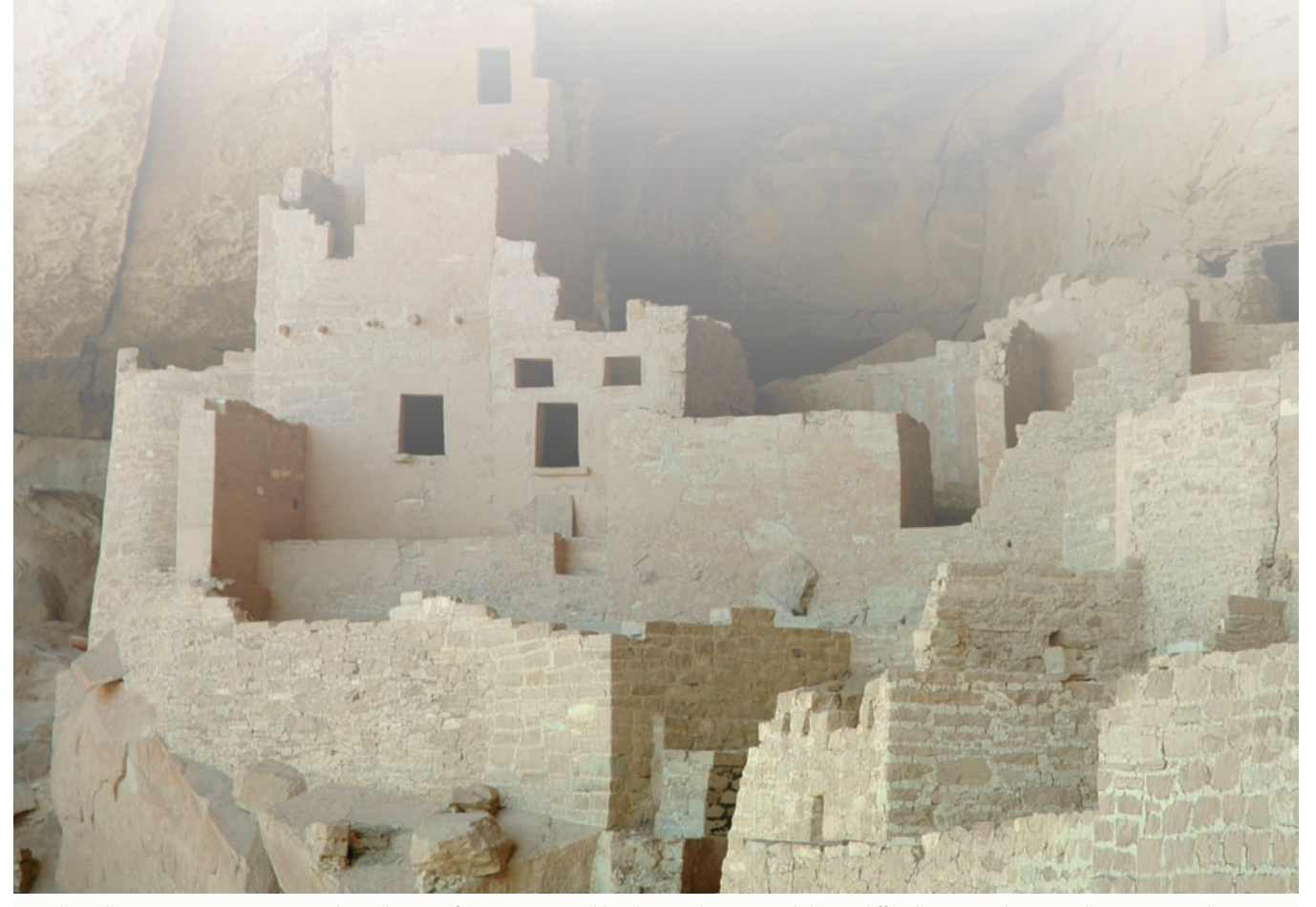
Archaeologists try to reconstruct the cultures of past societies like those who created this "Cliff Palace" in what is today Mesa Verde National Park.

Historical archaeology A specialty within archaeology that studies the material remains of recent peoples who left written records.